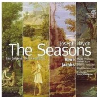
The Seasons by Joseph Haydn (CD)

MEANING Ceres shows you where you have control and power, but must deal with loss by compromising – seasonally or regularly - so that others may be empowered.